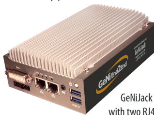
GeNiJack 301 with two RJ45 ports

GeNiJack 201, GeNiJack 301 and GeNiJack 401 are new integrated GeNiEnd2End Hardware Endpoints for NETCOR's GeNiEnd2End 24/7 end-to-end service monitoring software. It is very easy to deploy the GeNiJacks into the network to deliver End-to-End active performance monitoring and analysis of Triple Play network traffic. Under the control of the web based GeNiEnd2End network management and reporting solution the GeNiJacks monitor permanently the QoS and QoE performance metrics of Triple Play applications. In case predefined thresholds are exceeded, an alarm is generated for early problem detection.