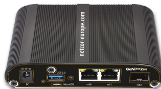
GeNiJack 201 with two RJ45 ports and one SFP port