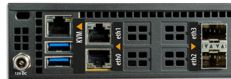
GeNiJack 401 with two RJ45 ports and two SFP ports